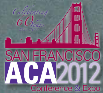
EXHIBIT WITH ACA IN SAN FRANCISCO & HELP US CELEBRATE OUR 60TH ANNIVERSARY!